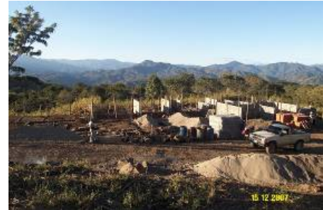
View from New Concepcion Project site