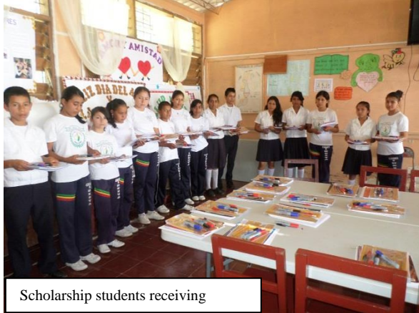
Scholarship students receiving

When we returned back to the U.S., it was time for back to school shopping. We made several trips to the local stores trying to find the perfect color or design of school supplies, a nice backpack, stylish clothes and shoes, etc.